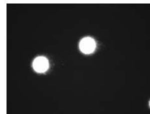
Fig. 4 Representative photograph of the anti-mutagenic effects of 0.5% VIBE in two cells showing the decreased (compared to Fig. 3) DNA density in the COMET tail after mutagen (UVR) exposure when cells were treated with VIBE (i.e. a significant DNA protective effect was evident with the VIBE treatment)

The results of this study show that multi-phytonutrient dietary supplement, VIBE, reduced DNA damage and