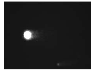
Fig. 3 Representative photograph of a positive control cell showing the increased DNA density in the COMET tail after mutagen (UVR) exposure without VIBE (i.e. no DNA protective effect was evident since VIBE was not included in this sample)

Statistics The non-parametric Mann–Whitney test was used to compare the UVR exposed VIBE-treated cells with the UVR exposed untreated (positive) control cells.